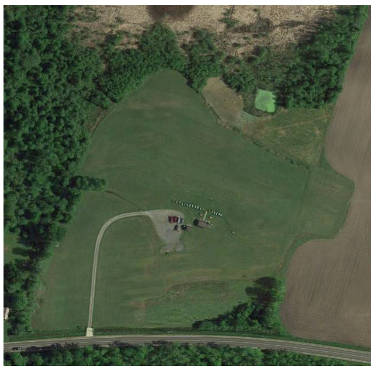
STARS Field Satellite photo